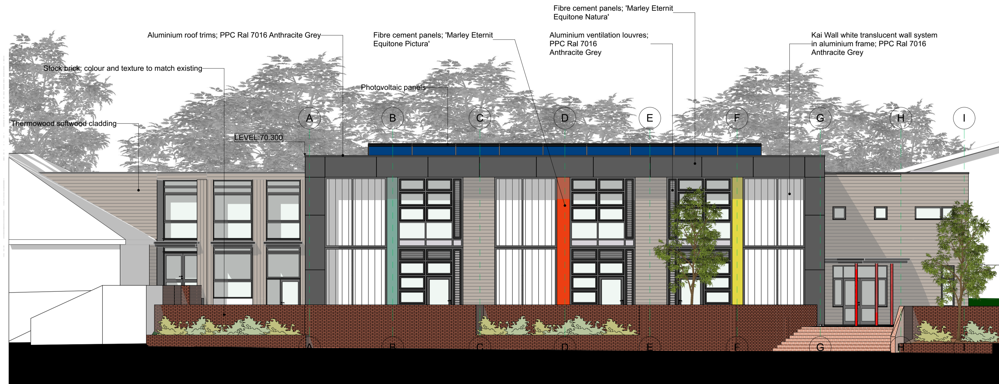
Site South Elevation