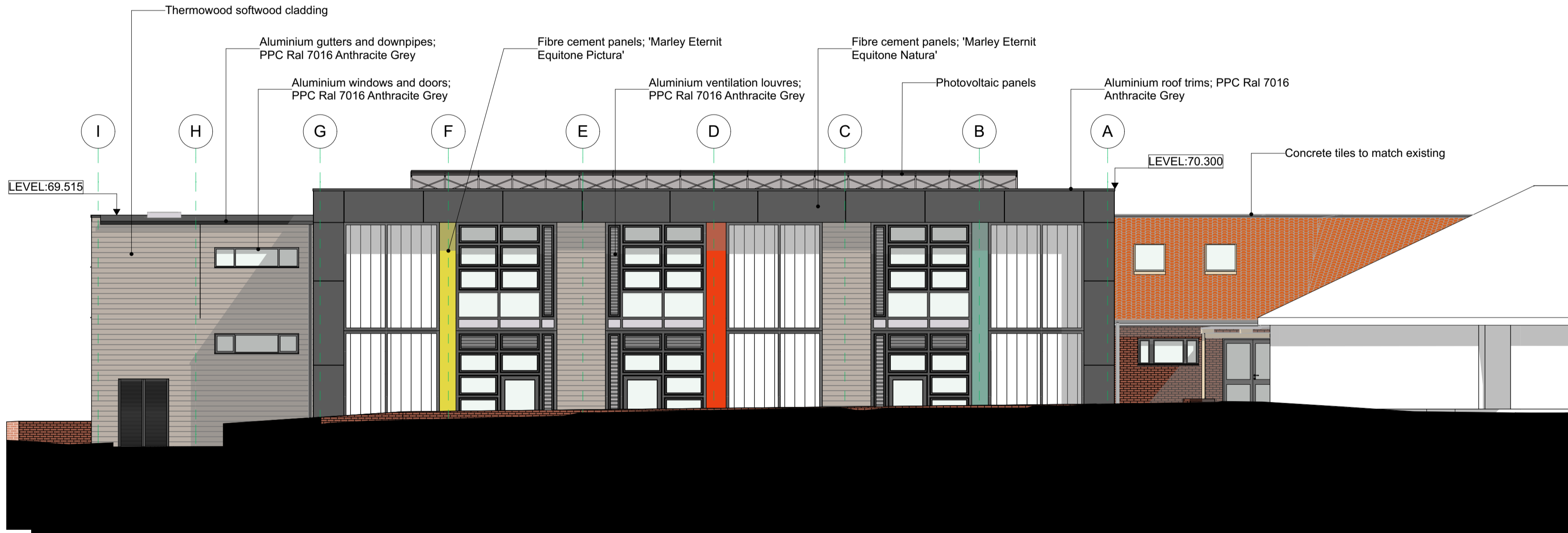
Site North Elevation