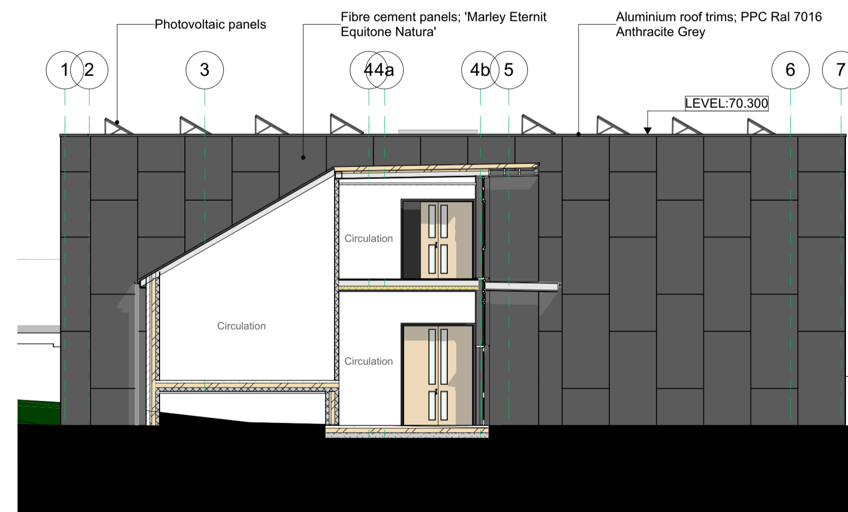
Site West Elevation